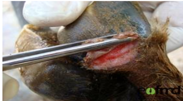
Figs. 2 and 3. FMD lesions in cattle. (L) Ruptured blister on the tongue. (R) Lesion on the coronary band.