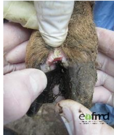
Figs. 4 and 5. Lesions in sheep. (L) Lesions on the digital pad. (R) Lesion on the foot.