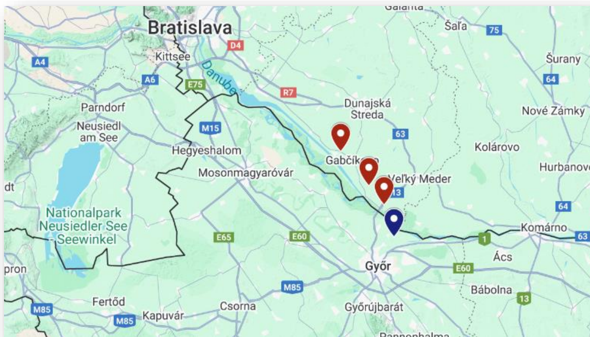
Map 2. Close-up map of outbreak confirmed on 6/3/2025 in Hungary (blue), and three outbreaks confirmed in Slovakia on 21/3/2025 (red)

There have been no movements of FMD-susceptible species (cattle, sheep, goats, pigs, buffalo, camelids) into Ireland from Hungary or Slovakia since 1 st Jan 2025.