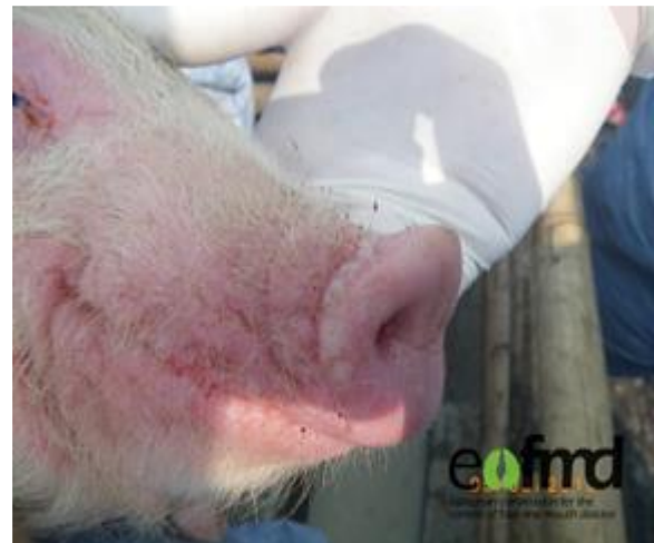
Figs. 5 and 6. FMD lesions in pigs. (L) Detachment of the claw from the coronary band (“thimbling”). (R) Blisters on the snout.